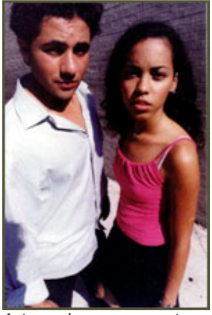
Actors play a pregnant couple in the Scenarios USA project "Just Like

"Even though many of our locations were Verena Faden interiors, I chose to shoot most of this film on (Kodak) Vision 250D stock," says Fraasa. "The speed, fine grain and contrast range of this film stock ideally suited the locations we were shooting. The scenes in the school hallways and gymnasium were lit with mercury vapor and fluorescents, which I complemented with HMIs and Kino Flos corrected with plus green gel. We liked the look of the green and left some of it in the final film to tape transfer. Some scenes, such as the party, were shot with (Kodak) Vision 500T and the interviews on (Kodak) Vision 200T."